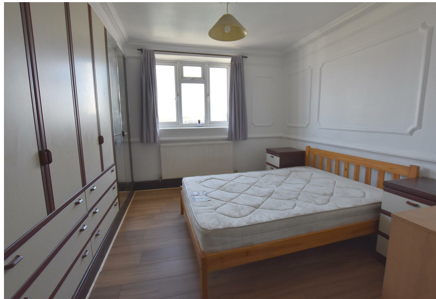
Lancaster Court, SW6